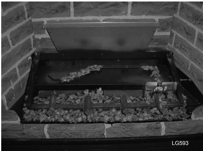
Burner Grate Assembly